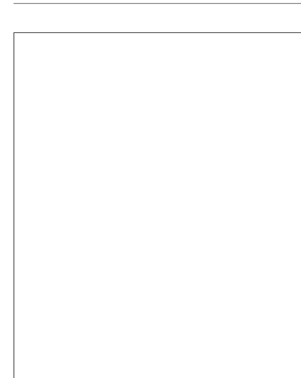
Fig. 1. The catchment area of the Osam River (location map). Ms – Muselievo – the site of the described thanatocenosis, main towns: Lk – Lewskij, Lv – Lovetch, Tr – Trojan; parts of the river course: M – mountains (upper course), U – Upland (mid course), L – lowland (lower course).